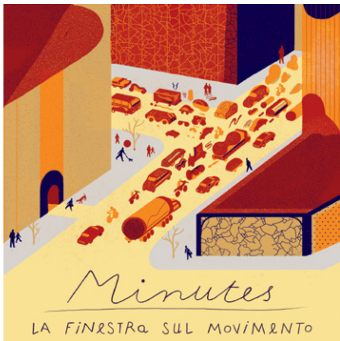
Dedar and Icinori Minutes